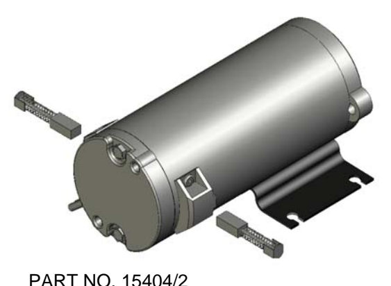
DESCRIPTION: EXTERNAL - BRUSH CLIP TYPE