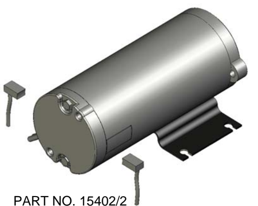
DESCRIPTION: INTERNAL BRUSH - SOLDER TYPE