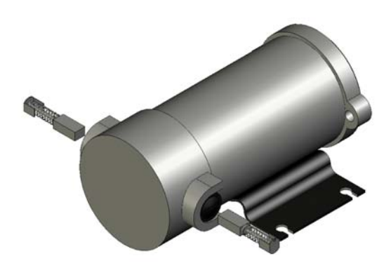
PART NO. 15220/2 DESCRIPTION: EXTERNAL BRUSH - SCREW TYPE

(MOUNTING FEET ARE NOT FITTED TO ML ACTUATORS)